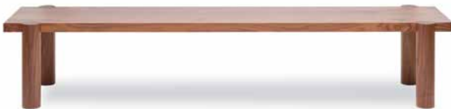
WALNUT > GALLERY