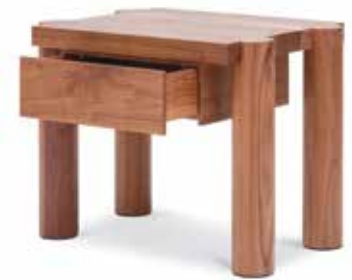
WALNUT > SMALL

Developed in two sizes to suit a variety of spatial requirements, the Bedside offers the unique Breadstick design in a condensed form. Continuing to celebrate the solid cylindrical timber legs, the piece is balanced out by a beautifully integrated solid timber drawer, offering an elegant, practical bedroom solution.