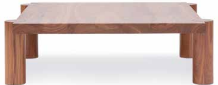
WALNUT > SQUARE