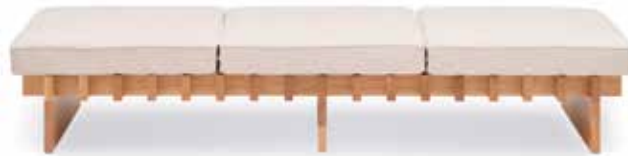
OAK > LINEN

From the Croatian word for dream , the San Daybed, combines geometry and ingenuity, cleverly assembled in a woven tapestry of intersecting timber pieces. Available with removable upholstered cushions in linen or leather, this versatile piece is at home in formal or casual spaces.