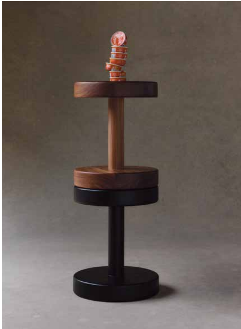
OAK & BLACK

Croatian for spool , this stool is inspired by the empty spool of a sewing machine, playing with a flexible, mirrored design, that allows the seat to be used either side up. Strong and durable, this solid timber stool offers optional use as a seat or side table.