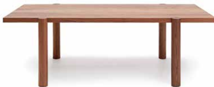
WALNUT > 230

The refined simplicity of the Table invites communion along its lengthened top. Available in two sizes to suit all spaces and occasions, this table will take you through the many stages of life, destined to become a treasured piece.