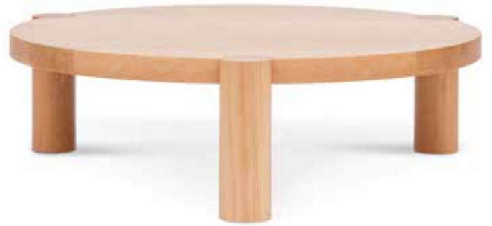
OAK > ROUND

A perfect gathering piece, the Coffee Table offers two iconic shapes to complement its setting. A key furniture piece celebrating materiality and function.