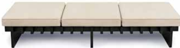
BLACK > LINEN