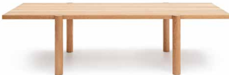
OAK > 280