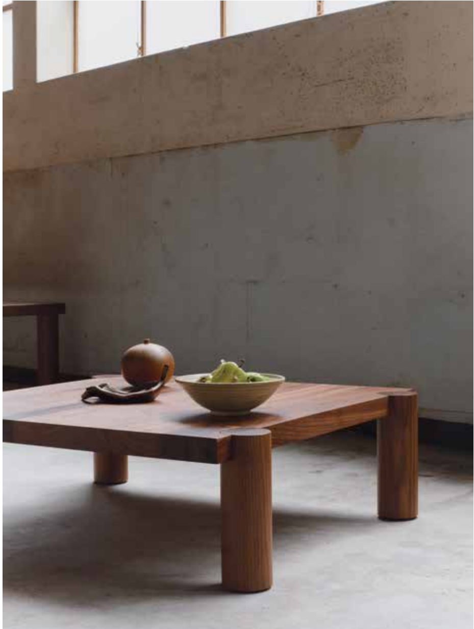
WALNUT > SQUARE