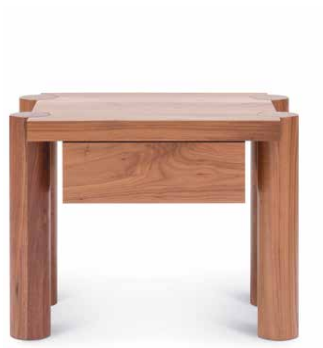
WALNUT > LARGE