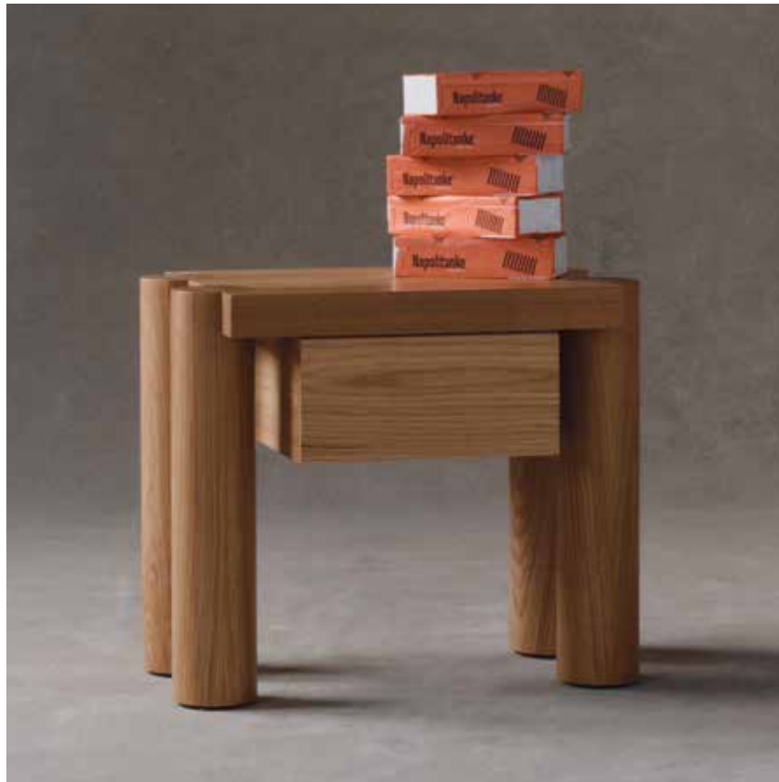
OAK > SMALL