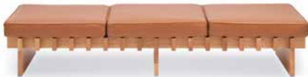
OAK > LEATHER