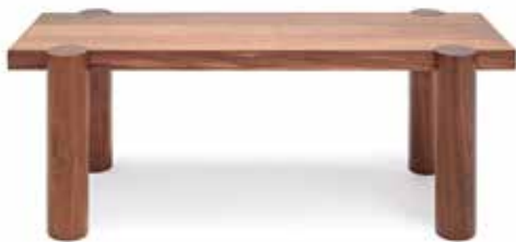
WALNUT > SMALL

A true piece of contemplative furniture, the Benches invite us to stay a while. This seat offers a chance to stop, engage, and repose; a nurturing experience affording the luxury of time, thought and dialogue. An elegant timber companion to any table, artwork, or space.