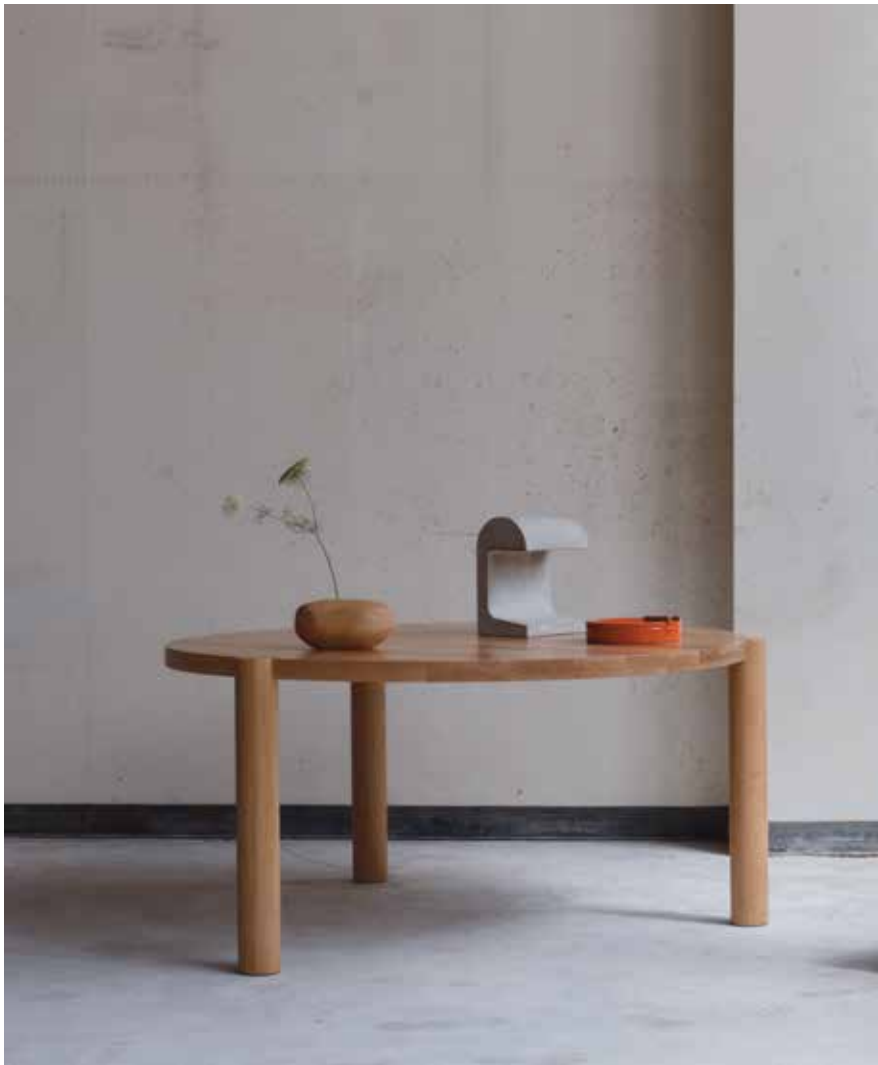
OAK > 150