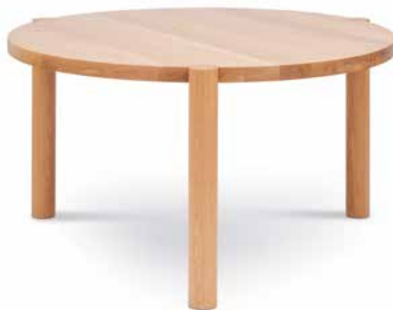
OAK > 150