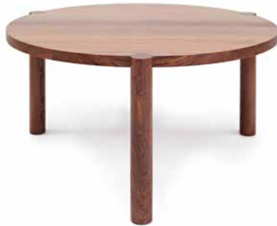
WALNUT > 150

Able to effortlessly accommodate six chairs, this Table's round shape encourages connection and collaboration. The top is crafted from multiple timber laminations combined to enhance the beauty of the wood.